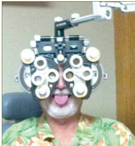
The health of your eyes is no laughing matter.